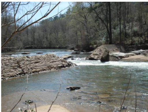
Old Power Plant Dam

CAMPSITE NUMBER: Hatchet Creek 3/R (Located ¼ mile downstream of Highway 231) COORDINATES: LAT/LONG N 32°56'46" W 086°12'29" UTM 3645595mN 574003mE 1:24000 QUAD SHEET Rockford, AL CAMPSITE NAME: Old Power Plant Dam Campsite ADDRESS: For information contact: Sally Holland Rt. 2 Box 114 Rockford, AL 35136 TELEPHONE: 256-377-4540 NOTE: The campsite is located on the right side of the creek just prior to the old dam site. Navigating through the break in the middle of the old dam can be hazardous. Inexperienced floaters should portage around the structure. MOTEL/CABINS CAMPING: No RV No TENT Yes, No charge WATER: No ELECTRICITY: No SHOWERS: No FIRE RING: Yes TOILETS: No FUEL: No SUPPLIES: No LAUNDRY: No DOCKS: No BOAT LAUNCH RAMP: No ACCESS FROM ROAD: No SHUTTLE SERVICES: No